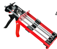
400ml Extrusion Tool

Once the damaged, decayed and discoloured wood has been removed by use of a suitable cutter tool such as a router or chisel, then the area to be treated is lightly sanded to ensure excellent adhesion. The moisture content of the wood should be no greater than 18% (check using a standard moisture meter) and damp wood should be allowed to dry naturally, or by way of a hot air gun. The two components are mixed manually into a separate container, and thoroughly agitated for one minute. The 2: 1 mixing ratio should be strictly observed. EWS should be applied directly onto bare wood in the repair area using a standard brush and then left to cure for 20 minutes, prior to carrying out the repair. The repair can then be applied when the EWS is still wet but before it is cured (usually after around 4 hours) Please refer directly to the Timbabuild® EWS data sheet for more details.