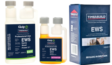
Epoxy Wood Stabiliser Packed 6 x 300ml per carton outer.

EWS primer system is a specially designed two-part low viscosity, solvent free, resin solution which is designed to strengthen weakened wood fibres by penetrating deep into the wood. The product is used as a primer in conjunction with the Timbabuild Wood Repair systems.