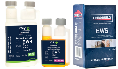
Epoxy Wood Stabiliser Packed 6 x 300ml per carton outer.

EWS primer system is a specially designed two-part low viscosity, solvent free, resin solution which is designed to strengthen weakened wood fibres by penetrating deep into the wood. The product is used as a primer in conjunction with the Timbabuild Wood Repair systems.